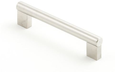
Satin Stainless Steel